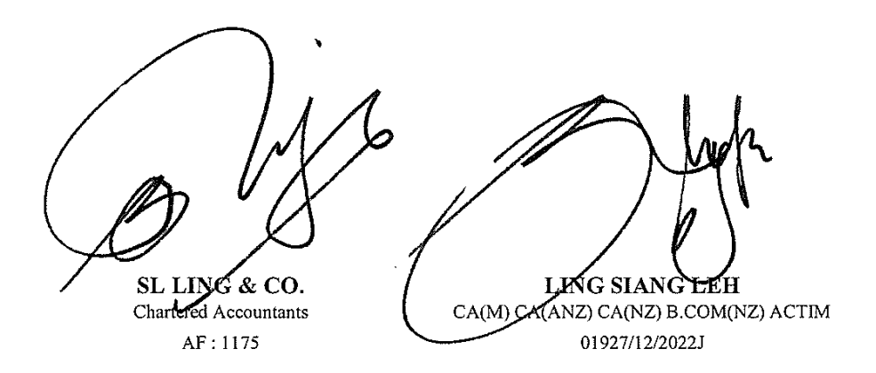
Address: 1122, 11th Floor, Block A, Damansara Intan, No. 1, Jalan SS20/27, 47400 Petaling Jaya, Selangor Darul Ehsan. Date: 2 3 NOV 2021

This report is made solely to the members of the Company, as a body, in accordance with Section 266 of the Companies Act 2016 in Malaysia and for no other purpose. We do not assume responsibility to any other person for the content of this report.